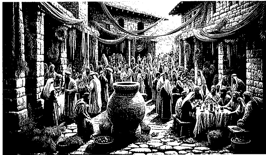
The Wedding at Cana in Galilee

said to her, "Woman, what concern is that to you and to me? My hour has not yet come." His mother said to the servants, "Do whatever he tells you." Now standing there were six stone water jars for the Jewish rites of purification, each holding twenty or thirty gallons. Jesus said to them, "Fill the jars with water." And they filled them up to the brim. He said to them, "Now draw some out, and take it to the chief steward." So they took it. When the steward tasted the water that had become wine, and did not know where it came from (though the servants who had drawn the water knew), the steward called the bridegroom and said to him, "Everyone serves the good wine first, and then the inferior wine after the guests have become drunk. But you have kept the good wine until now." Jesus did this, the first of his signs, in Cana of Galilee, and revealed his glory; and his disciples believed in him.